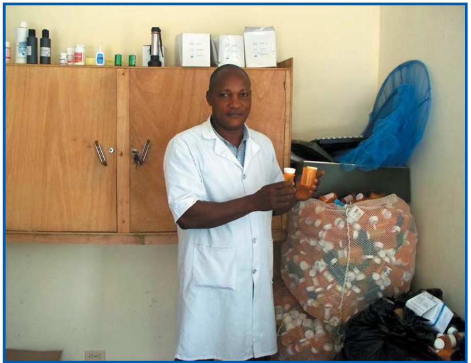
Doctor with bags of donated pill bottles at Emmanuel's clinic.