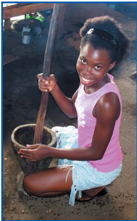
Girl from the orphanage cooking in the kitchen area.