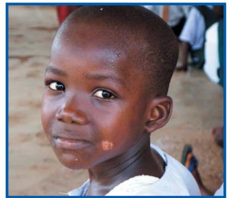
Boy at a rural village.