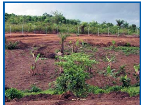
Fencing with barbwire on top.