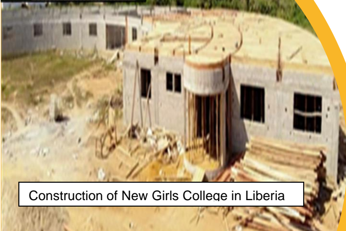
Construction of New Girls College in Liberia