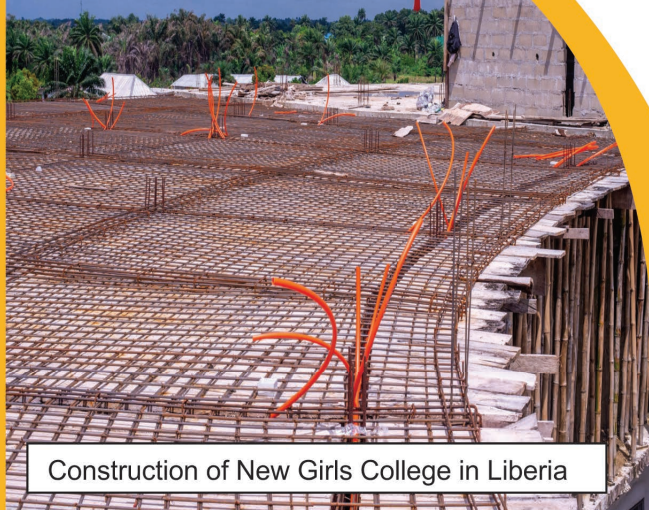
Construction of New Girls College in Liberia